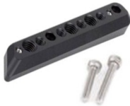
Wireless Side Plate