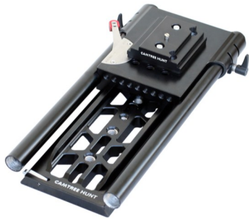
Dovetail plate with base clamp with 19mm female rods

Please inspect the contents of your shipped package to ensure you have received all that is pictured and listed below.