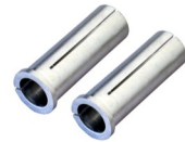
15mm rod mount